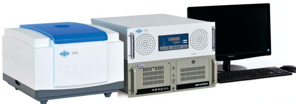
T2 Relaxation Time